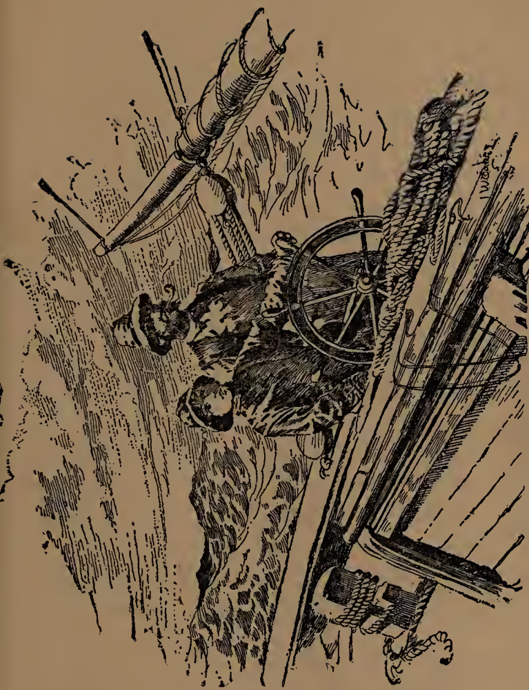
“THERE WERE DAYS OF LIGHT AIRS, WHEN HARVEY WAS TAUGHT HOW TO STEER THE SCHOONER FROM ONE BERTH TO ANOTHER.”